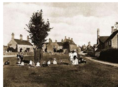
Wimbotsham, The Green

Memorial Seat , around the large lime tree, the seat has memorial plaques naming the people involved in setting up The Fenman Classic Bike Show in 1988. Walk on to the centre of the green and note the high beacon lit on special occasions. The Village Green (a large triangular shape) contains some mature trees planted in early 1900s. Move on to the War Memorial at far end of the green.